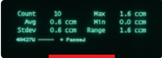
SPC Data Screen

Simply program the desired leak reject level and cycle a known good part. The unit will automatically establish all pertinent settings and you are ready for production testing: