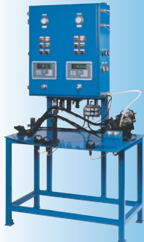
Model 2100 Dual Station Filler Pipe Leak Test Stand